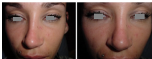
Fig. 3: Medical rhinoplasty. Treatment of a nose deviation with 0,4 cc of hyaluronic acid.

this case, it is very useful to “remove” this adherence with a bolus of hyaluronic acid to avoid a permanent retraction. Fibrosis appears in the filled space after multiples injections, and in many cases this maneuver can avoid a surgical procedure (figs 4, 5).