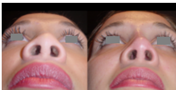
Fig. 5: Medical rhinoplasty after two surgeries.