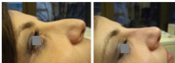
Fig. 2: Medical rhinoplasty. Treatment of the tip with 0,7 cc of hyaluronic acid and botulin toxin in the depressor muscle of the tip.

Every irregularity (depression of nasal bridge, asymmetry, deviation...) can be filled with a filler (fig. 3). The indications of these fillings are the same as cartilaginous grafts. The injection of a filler following surgical rhinoplasty can be very interesting too. In some cases, adhesences are revealed after the removal of the nasal splint (mobilization of a bone or a cartilaginous fragment). In