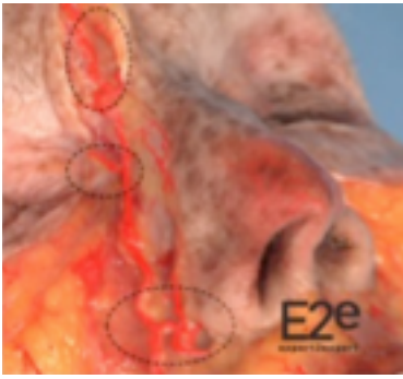
Fig. 1: Anatomical basis.

Practical applications arising from this relationship refer to the morpho-dynamic anatomy concept.