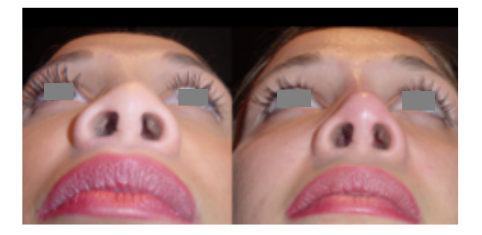
Fig. 5: Medical rhinopasty after two surgeries.